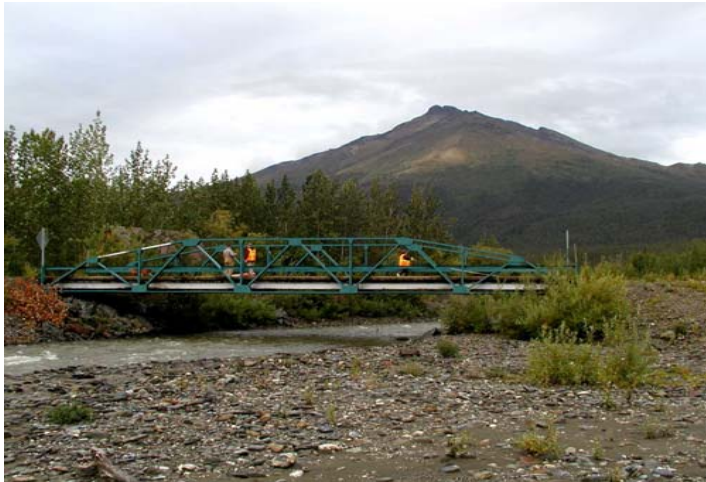
Photo 3: Wiseman's 1-lane bridge; photo by Nicole Grewe, DCRA©, August 2006.