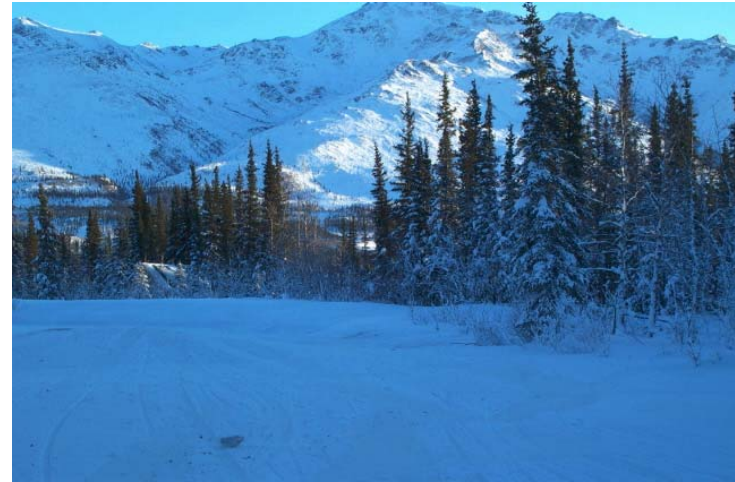
Photo 2: Wiseman Creek levee; No photo date available