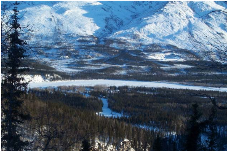
Photo 1: Wiseman Creek as it winds through Wiseman to The Koyukuk River; photo by Heidi Schopphorst, No photo date available.