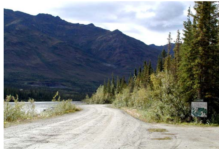
Photo 4: Access road to Wiseman is adjacent to the middle fork Koyukuk River; photo by Nicole Grewe, DCRA©, August 2006.